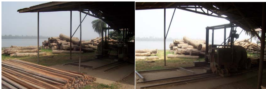
Figure 2: Timber processing near a beach in Nigeria

Timber cutting is one of the major activities in the coastal areas of the GCLME especially in the coast of Cameroon, Nigeria and Gabon, although actual quantity cut from the area is not well documented. Figure 2 shows a timber processing factory near a beach in Nigeria.