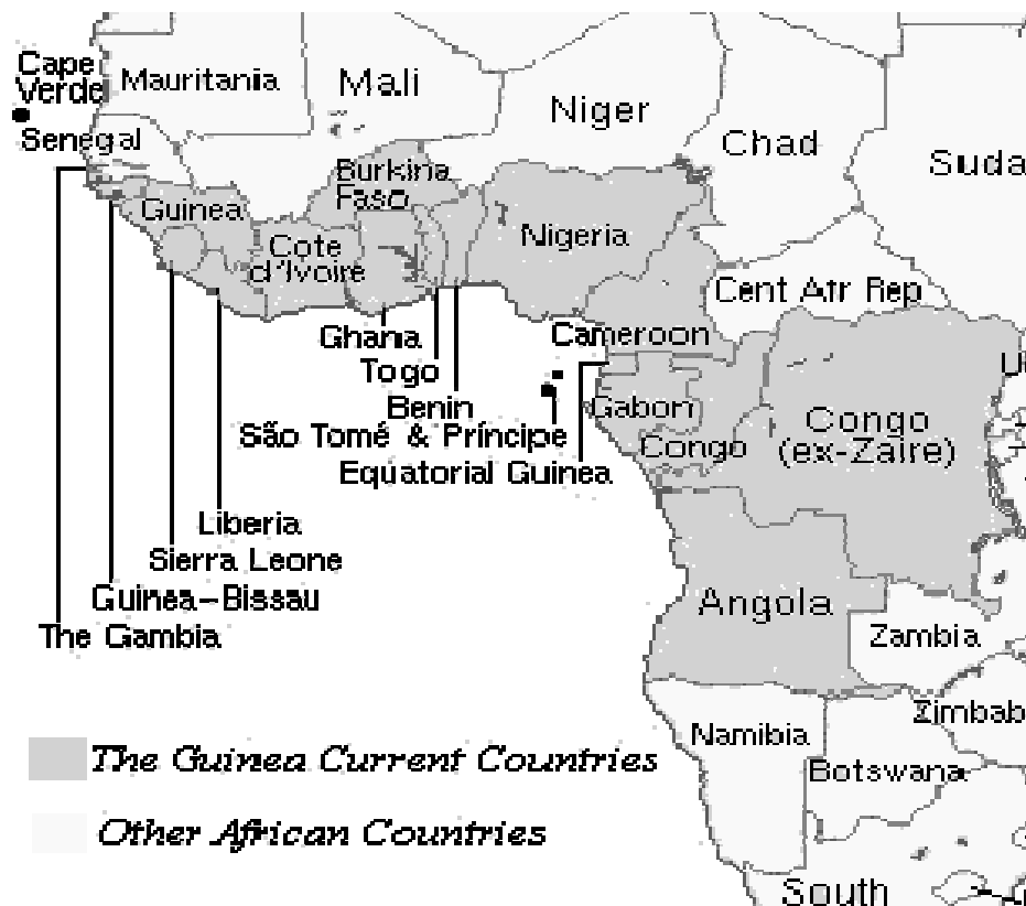
Figure 1: Map of Africa Showing the GCLME countries

degraded habitats; and reduce land and ship-based pollution by establishing a regional management framework for sustainable use of living and non-living resources in the GCLME. The economic valuation of ecosystem services and marine resources of the guinea large current marine ecosystem is a sub-component of the project towards achieving the stated goals.