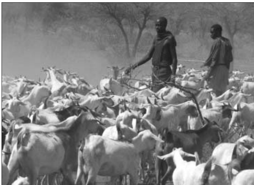
Livestock raised under mobile systems and common property regimes make optimal use of scarce and dispersed resources while contributing to collaborative relationships between different groups.

Chapter 2 presented available data on sales and exports of milk, livestock, hides and leather. Other marketed produce includes timber and non-timber forest products such as fruits, berries, honey, and medicines, which are harvested from the bush (see below). These goods are critical sources of income for women and poorer individuals within